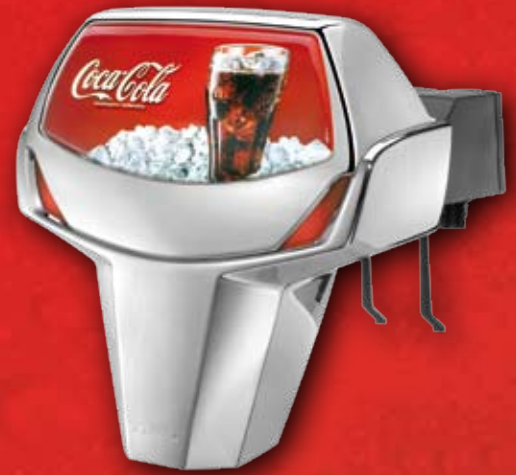
Nueva Style Taxi

IMI Cornelius Europe www.imi-cornelius.net